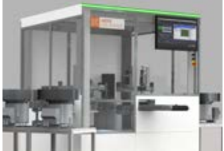
Housing Infeed Systems