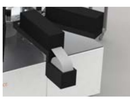
Strip Infeed - Reel