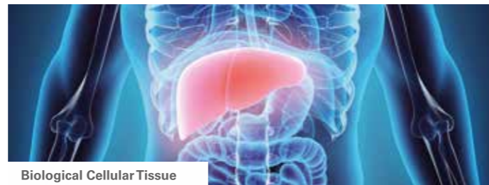
Biological Cellular Tissue