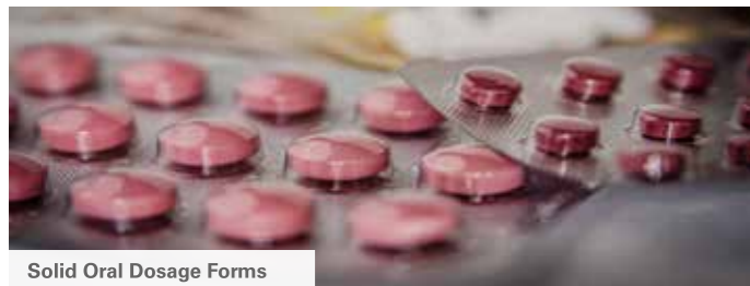
Solid Oral Dosage Forms